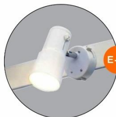
E-01 射燈(白色) Spotlight (White) 23W