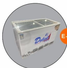
E-11 座地冷凍冰箱(-18度) (不包括電插座) Chest Freezer(-18°C) (Excluding Socket)