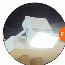
E-04 泛光燈(小太陽) Halogen floodlight 300W