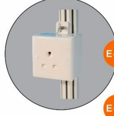
E-12 插座(不能用於照明用電) Single Phase Socket (for machine only) 1000W(220V)