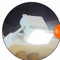
E-05 泛光燈(小太陽) Halogen floodlight 500W