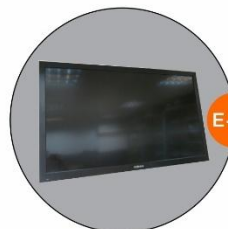
E-10 43"電視機 (不包括電源插座) 43" TV (Excluding Socket)