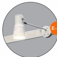
E-02 長臂射燈(白色) Long-arm Spotlight (White) 23W