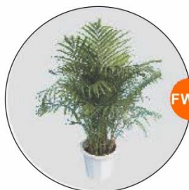
FW20 植物 Plant 1M(H)