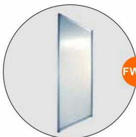
FW19 屏風板 Single wall side panel (1Wx2.5H)M