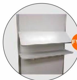
FW16 層板 斜 / 直 Shelf - Flat / Slope (1Wx0.3D)M