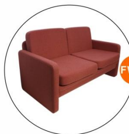
FW13 雙座位梳化(粉紅色) Two-Seat Sofa(Pink) (1.3Wx0.6D)M