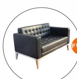
FW14 雙座位真皮梳化 Two-Seat Leather Sofa (1.35Wx0.52D)M