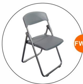
FW07 灰色摺椅 Folding Chair(Gray)