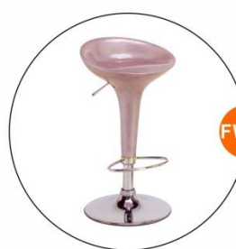
FW10 油壓吧椅 - A款 Bar Stool - A