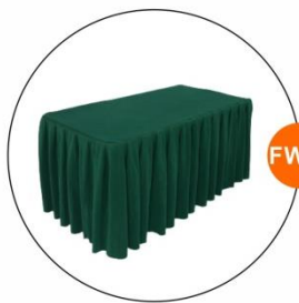
FW05 詢問枱配綠色枱裙 Information Counter with Green Skirting (1.8Wx0.75Dx0.75H)M