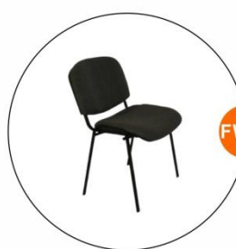
FW09 低背座椅(灰色) Chair in Gray