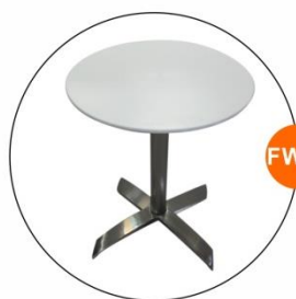
FW02 圓檯 Round Table (Ø0.6x0.68H)M