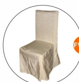
FW12 嘉賓座椅配椅套 (米色) Guest Chair with Cover (Cream)