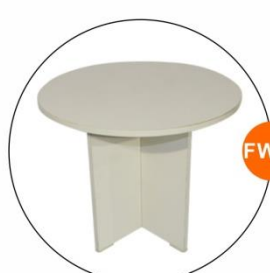
FW04 灰色圓型會議檯 Round Conference Table in Gray (Ø0.9x0.77H)M