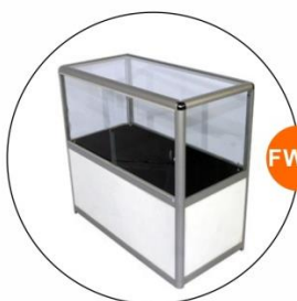
FW17 矮身展櫃(不設照明) Low Showcase(w/o lighting)