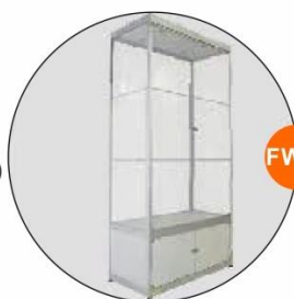
FW18 高身展櫃(不設照明) Tall Showcase(w/o lighting)