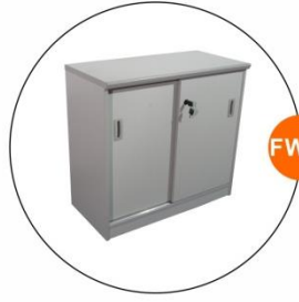
FW06 矮身儲物櫃 Cabinet (1Wx0.5Dx0.75H)M