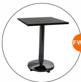
FW03 方檯 Square Table (0.6Wx0.6Dx0.74H)M