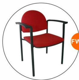
FW08 紅色扶手客椅 Armchair in Red