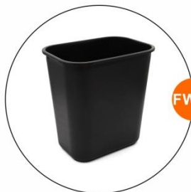
FW22 廢紙箱 Litter bin