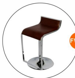
FW11 吧椅 - B款(黑色/白色) Bar Stool - B(Black/White)