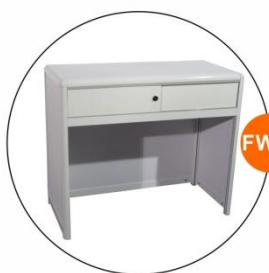
FW01 有鎖詢問檯 Lockable Information Counter (0.95Wx0.5Dx0.8H)M