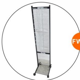
FW21 雜誌架 Magazine Rack