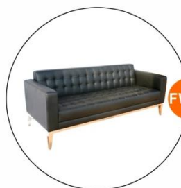
FW15 三座位真皮梳化 Three-Seat Leather Sofa (2Wx0.75)M