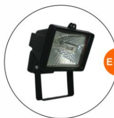
E-04 泛光燈(小太陽) Halogen floodlight 300W