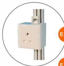
E-12 插座(不能用於照明用電) Single Phase Socket (for machine only) 1000W(220V)