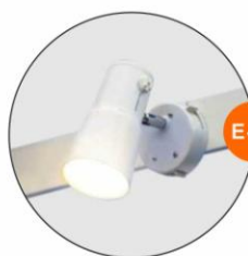
E-01 射燈(白色) Spotlight (White) 23W