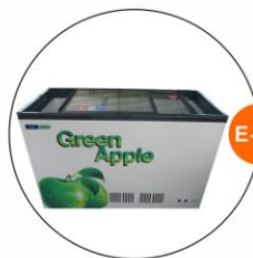
E-11 座地冷凍冰箱(-18度) (不包括電插座) Chest Freezer(-18°C) (Excluding Socket)