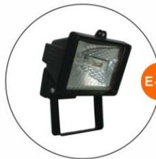
E-05 泛光燈(小太陽) Halogen floodlight 500W