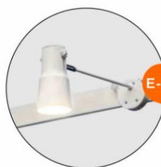
E-02 長臂射燈(白色) Long-arm Spotlight (White) 23W