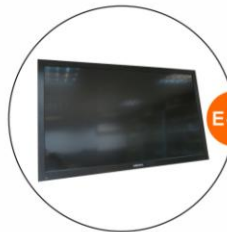
E-10 43"電視機 (不包括電源插座) 43" TV (Excluding Socket)