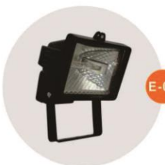
E-05 泛光燈(小太陽) Halogen floodlight 500W