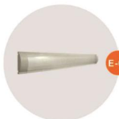
E-03 光管 Fluorescent Tube 28W