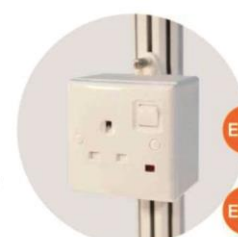
E-12 插座(不能用於照明用電) Single Phase Socket (for machine only) 1000W(220V) E-13 1500W(220V) E-14 2000W(220V) E-15 2500W(220V) E-16 3000W(220V)

Remark: Each socket / power supply is for the use of one electrical appliance / machinery only. No-multi-plug is allowed.