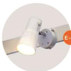
E-01 射燈(白色) Spotlight (White) 23W