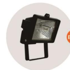
E-04 泛光燈(小太陽) Halogen floodlight 300W