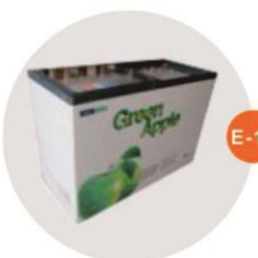
E-11 座地冷凍冰箱 (-18度) (不包括電插座) Sitting Style Refrigerator (-18°C, Excluding Socket) 1.28M(W)x0.57M(D)