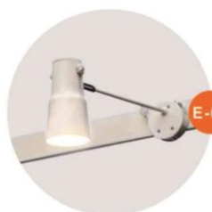
E-02 長臂射燈(白色) Long-arm Spotlight (White) 23W